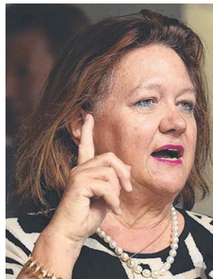
SUPPORT: Gina Rinehart

Ms Rinehart said although Australia is at a low point in terms of demand for resources, the cyclical nature of the industry has been a constant.